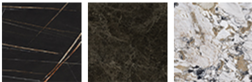
KM09 Sahara Noir brillant