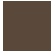
LM22 castor Ottawa Fenix