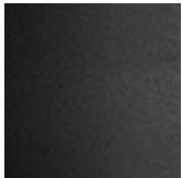
GFM69 gauféré graphite