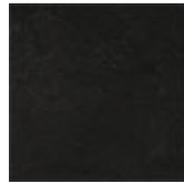
LM06 ossido gris