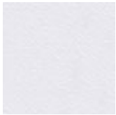
LM02 blanc climb