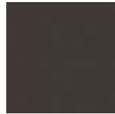
LM21 gris Londres Fenix