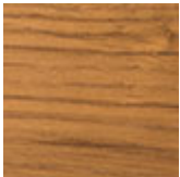
HR rouvre Heritage