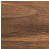
NC noyer canaletto