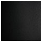
GFM73 gaufré noir