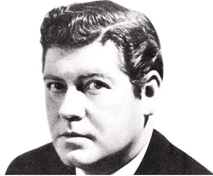
PAUL McCOBB (1917-1969)

Paul McCobb's innate understanding of perspective paved the way for a career as one of the most important design figures of his time. The self-taught designer's pragmatic yet perfectionist nature was reflected in his work, characterised by slender, graphic lines, a simplicity of form and lightness of design. His trademark scale and perspective imbued his no-nonsense designs, which focused on simplicity and functionality, pared-back to their purest forms.