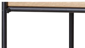
OAK VENEER POWDER-COATED STEEL

The Bauhaus-inspired lines of each unit are crafted in durable powder-coated steel with a slightly matte finish. The joints are welded by hand and gently rounded to soften the overall expression. Diagonal rods on the two larger designs lend added support, while creating visual interest in the negative space. Shelves are made with oak veneer, bevelled at the edges to fit seamlessly with the frame – one of many small but significant details.